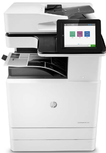
HP Color LaserJet Managed MFP E77825dn

Businesses that stay ahead don't slow down. It's why HP built the next generation of HP Color LaserJet MFPs—to power productivity with a streamlined design that delivers premium color value, maximum uptime, and the strongest security. 1