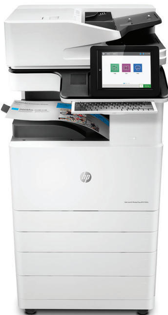
HP Color LaserJet Managed Flow MFP E77825z