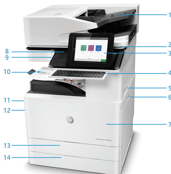
HP Color LaserJet Managed Flow MFP E77825z